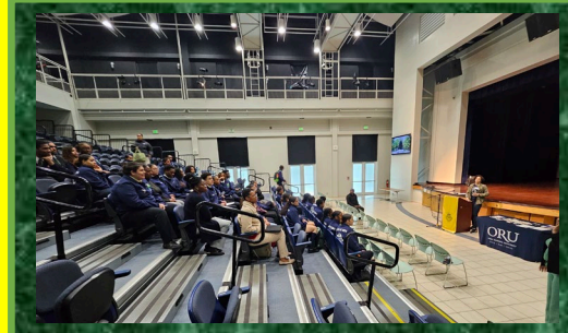
Whole Leaders for the Whole World