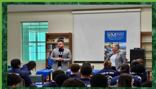
'Truth Leads to God'