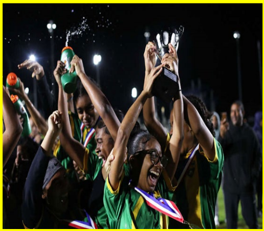
Proud Lady Panthers – celebrate winning the BSSF Knock Out Final at the NSC