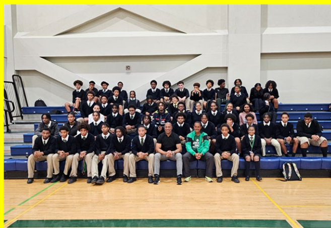
Les Ferdinand Visits The Berkeley Institute