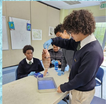
'Speared then Prepared': Berkeley students catch a half dozen lionfish at Cooper's Island in St. David's.