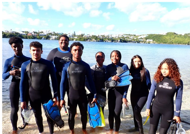
Marine Science Students Eat'um to Beat'um

"The mission of The Berkeley Institute, a diverse senior school with a rich heritage and tradition of excellence, is to ensure a stimulating learning environment that prepares all of its students to lead full and purposeful lives and to assume leadership roles in both the local and global communities." Revised April 2019