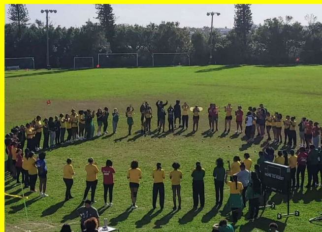
Cross Country Meet Opens with Halo of Support