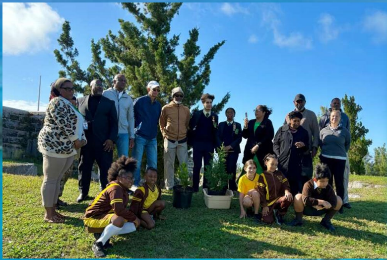
Trees of Life: Parents, students, activists and politicians in front of two peace trees at Fort Scaur.