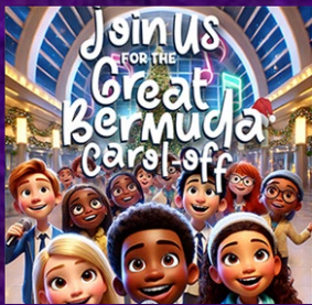
“Spreading Holiday Cheer!” – Berkeley’s choir captivates hearts.